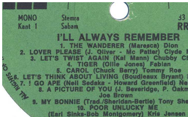
Mono - type 2